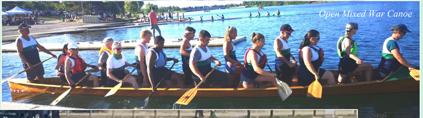
Open Mixed War Canoe