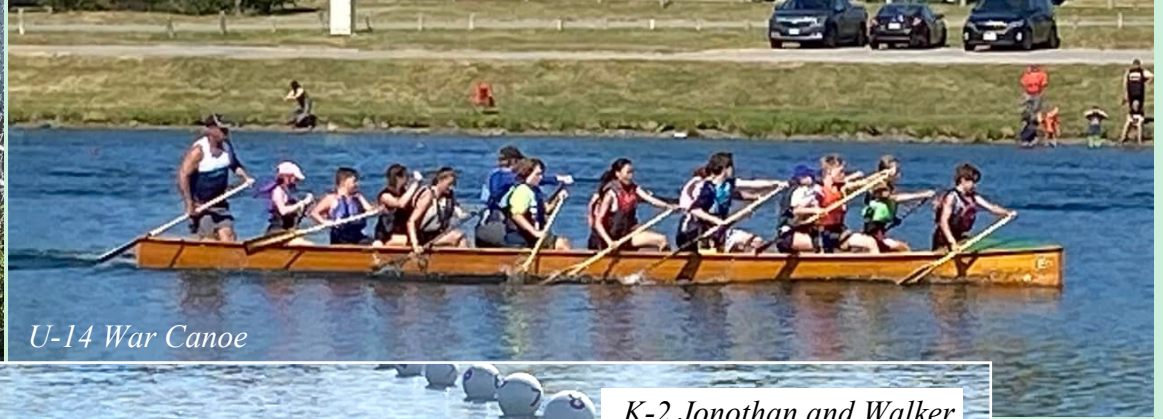
U-14 War Canoe