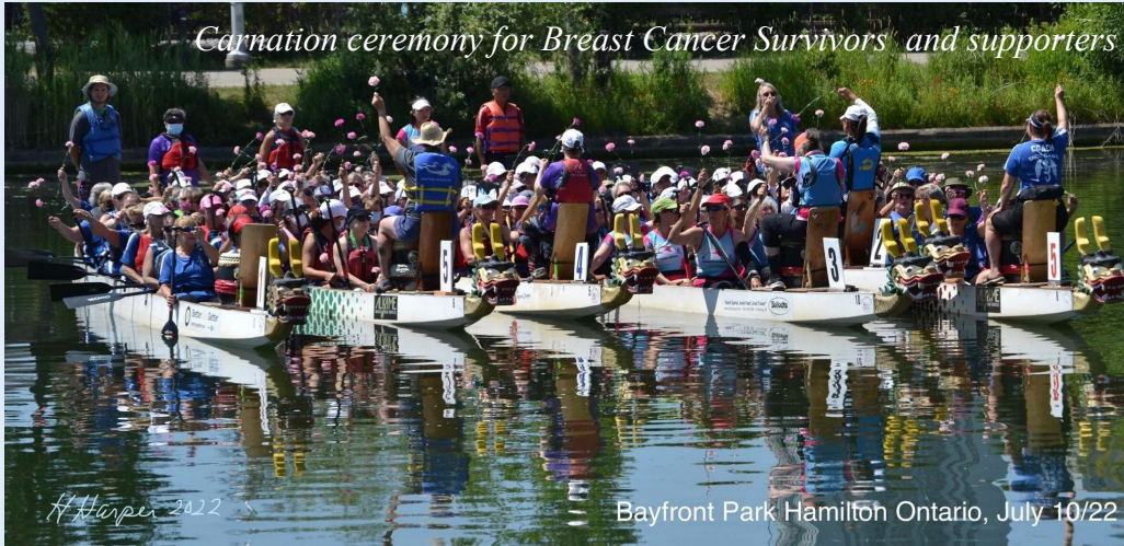
Carnation ceremony for Breast Cancer Survivors and supporters

Dragon boat racing is back after a covid-19 hiatus and SNCC made themselves known! The Mixed team placed in B Division for the 500m finals and in A Division for the 2000m races. The Women's team also placed in B Division for their 500m finals (and won Gold!) and in the A Division for the 2000m races. The Hatchlings placed in C