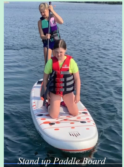
Stand up Paddle Board