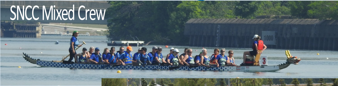
SNCC Mixed Crew

Held June 10 on our home course. A fun and local festival that is also a qualifier regatta