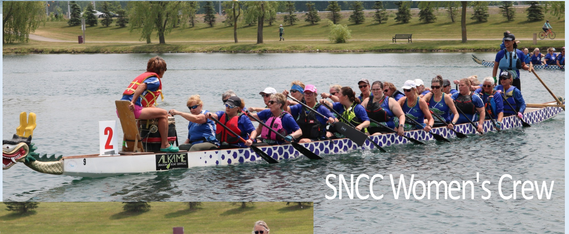
SNCC Women's Crew

for the Canadian Dragon Boat Championships later in July.