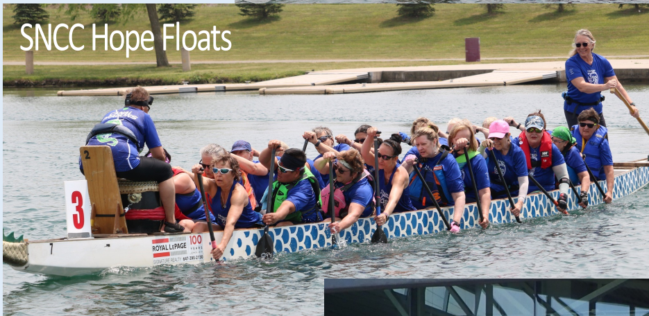
SNCC Hope Floats

A Carnation Ceremony was held to honour Breast Cancer Survivors.