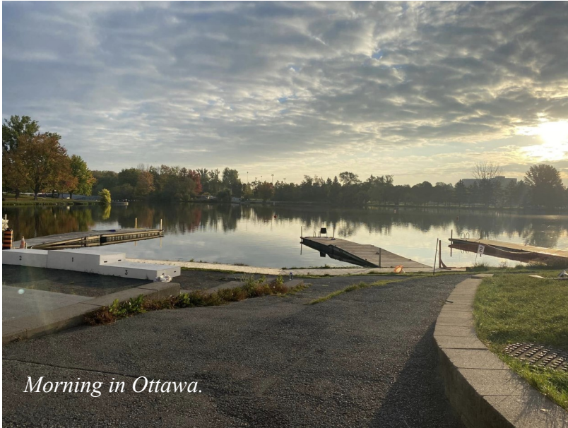
Morning in Ottawa.

Ontario Team Fall Training Camp – Ottawa September 29 to October 1, 2023